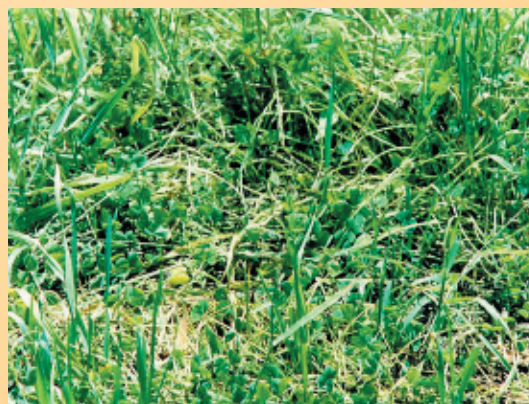
Maintain good pastures

Sand colic is largely preventable if land management is sound.