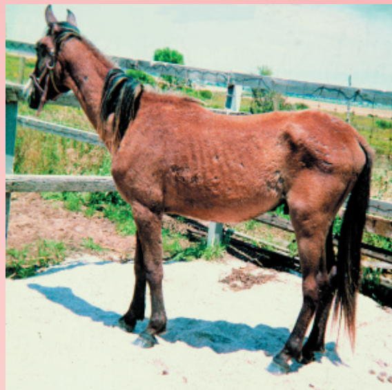
Dull coat and loss of weight

Seek veterinary advice if condition does not improve.