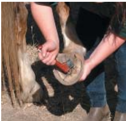
1. Clean the hoof using the hoof pick and brush