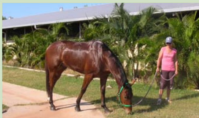
More horse images from the NT. Above: A racehorse enjoys an afternoon pick at Fanny Bay Racecourse. Below: Community horse yards at Blatherskite Park, Alice Springs.