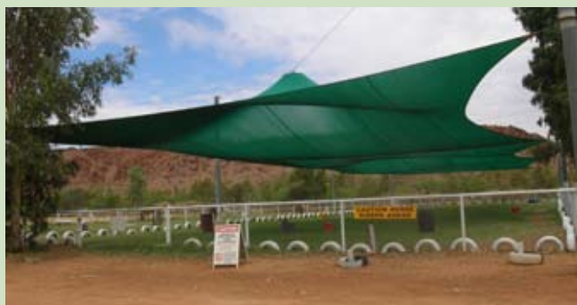
In Alice Springs, shade cloth covers the RDA riding arena.